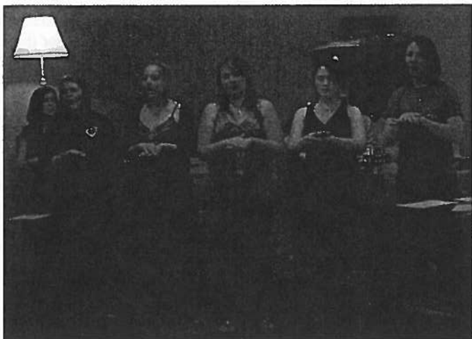
Music Therapy students at "Open Mic Night"