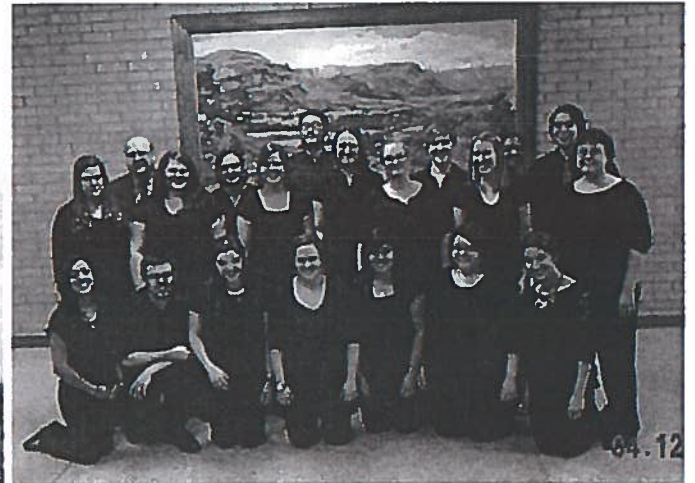
The Music Therapy Club

Please keep in touch and if you are ever in town, we'd love to see you. Below is a picture taken after the Spaghetti and Song fundraiser.