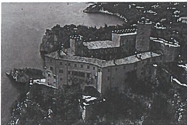
The Duino Castle