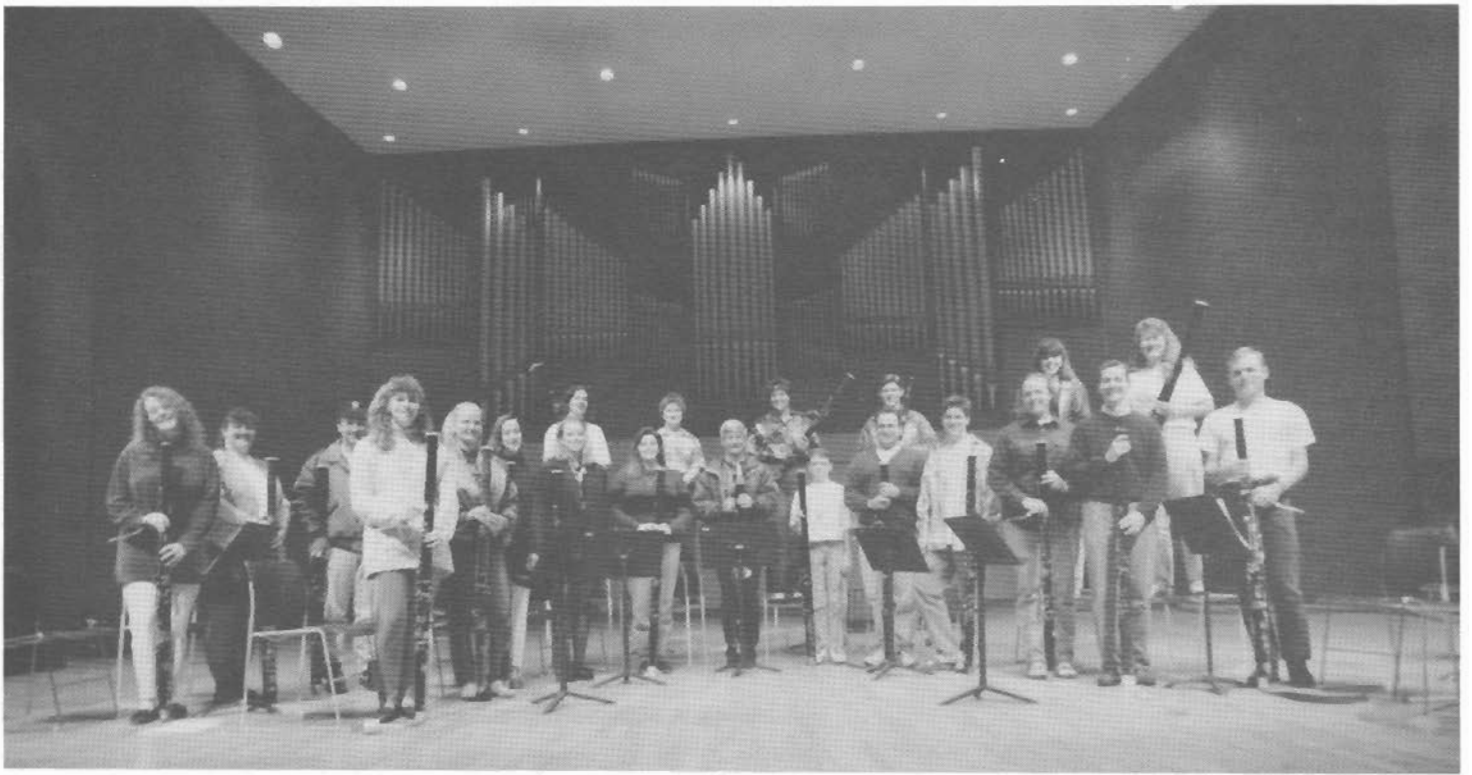
1994 WTAMU Bassoon Bash Participants