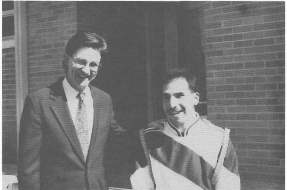
New Marching Band Director

This year we've added something new to our listing. There is a small number after each name to indicate your number of years as a contributor (and we apologize if we haven't credited you with the proper number). We have noticed that many of our givers contribute year after year and we wanted to acknowledge this ongoing aspect of your stewardship. We hope you approve of this added feature of our listing. But most importantly, we want you to know how much we appreciate your continuing support, year after year. We literally