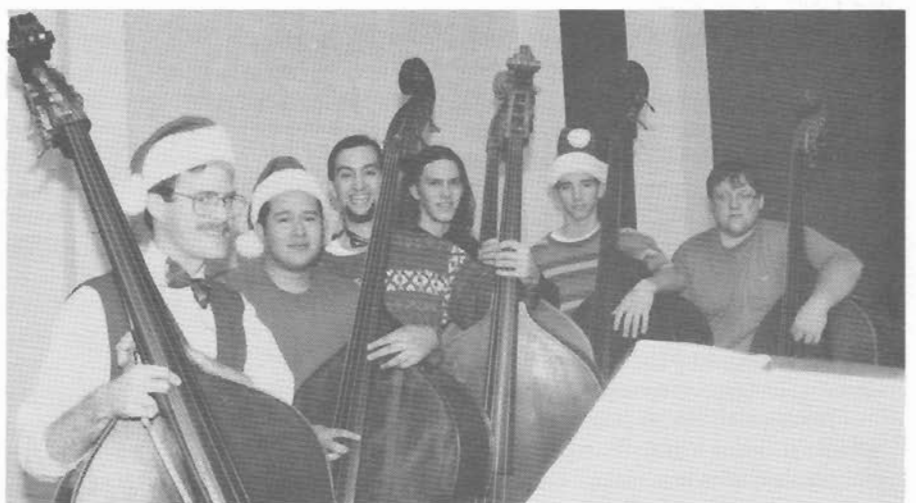
Bass Buddies Perform Christmas Carols for the Annual College Potluck Dinner