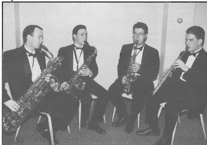
The Paragon Saxophone Quartet