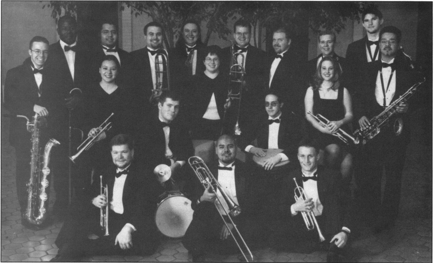
University Jazz Band